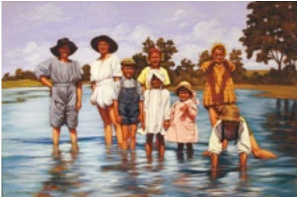
Always Take Time To Cool Your Toes

grimacing faces. Then there are those that are a delightful moment in time....like the poor kid who lost his ice cream or the young couple cooking at a campfire. The search is challenging, because I never use anything from magazines, that has been published or reprinted and sold in multiples....that would be too easy! Finding good material is like digging for gold...."