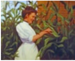
Corn's Not The Only Thing That's Bored