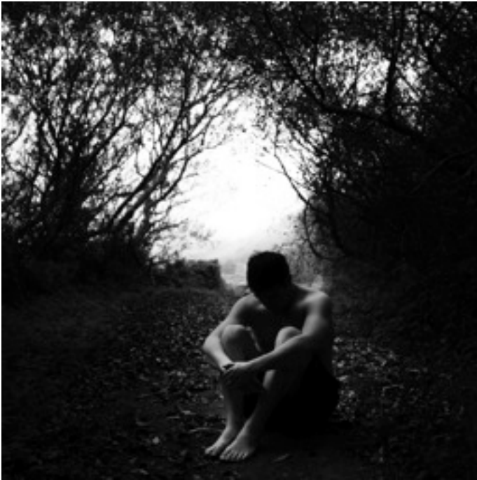
It's Only Me