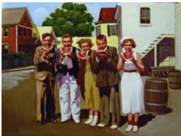
All Together Now

Polly continues, "One of the enthralling things about working with old photographs is finding the ones that tell a story. There are bushels of old prints showing people standing rigidly, arms at sides, with