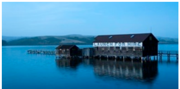
Launch for Hire, Point Reyes Workshop