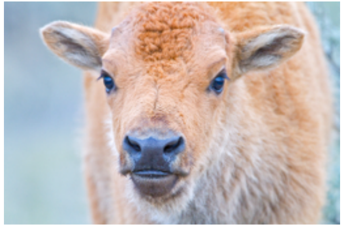
Bison Calf Portrait

Asked about the challenges of wildlife photography, Jim admits that they are legion. “Finding the subject is often challenge enough. Photographing wildlife