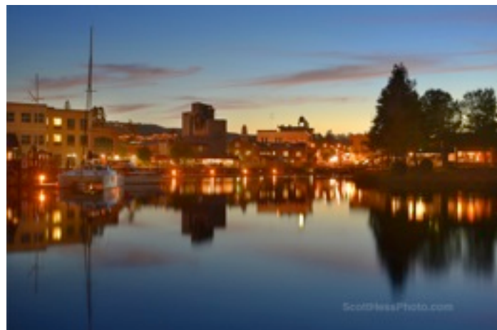
Autumnal Equinox Evening, 2012, Petaluma, CA