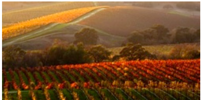
Last Colors, Fall Wine Country Workshop