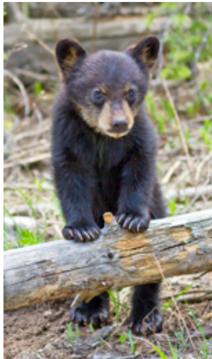
Black Bear Cub

can be difficult and frustrating, because wild animals can't be controlled by the photographer. They are often in settings that are unattractive and/or distracting. Often the lighting is bad. Body position is another problem. I usually try to get the animal to make eye contact with me, hoping the engagement between us eventually gets transferred to the viewer of the image. Of course, eye contact can trigger a quick departure of subjects as well. Many a situation with great photographic potential has been ruined by their movement, even if they don't exit the scene. But when the background, lighting and animal position, including eye contact, are all optimal, good things happen.”