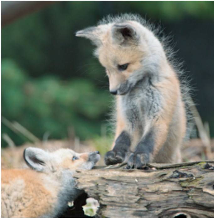
Red Fox Kits