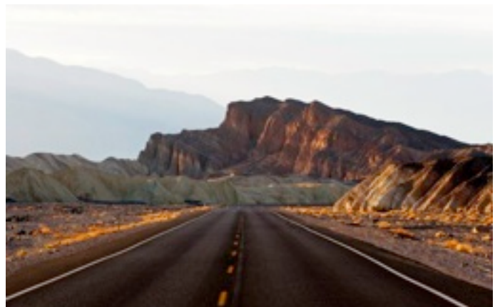
Road to Zabriskie, Death Valley Workshop